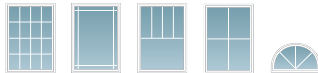
Colonial Prairie A Tall Fractional Specified Equal Light (2 x 2) Sunburst**

All grille options are available in a variety of patterns.